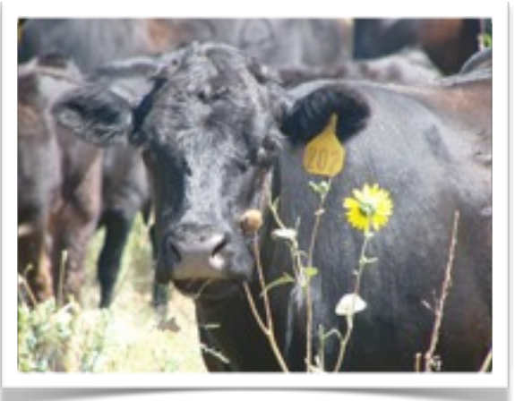
Cow enjoying sunflowers.