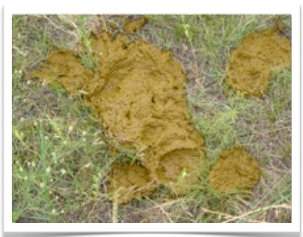
Loose stools like this one are indicative of a high protein diet.

Since it appeared that the cows were not going to graze dalmatian toadflax or late-season diffuse knapweed, I decided to find out why they preferred the plants they were selecting over the target weeds and grasses. I took samples of plants that cattle were eating, collecting the parts of the plant that I observed they selected, and sent them off for nutritional analysis. Since we know that nutrients increase palatability, my hypothesis was that they were choosing very nutritious foods. In fact, given the nature of their manure, I guessed that the plants they were selecting were generally high in protein.