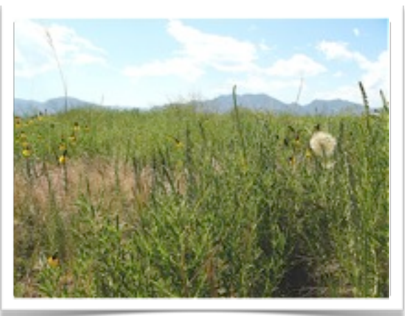
An example of the kind of pasture my 2009 project herd liked most.

As I followed the herd, what I noticed was that they generally avoided the grassier areas and preferred the "garbage area." Cows and calves moved purposefully to the large sunflower patches, grazing sunflower blossoms after their noon watering break. When they had their fill of those, they searched for bindweed patches among the prairie dog holes or along fence lines, snipping off yucca fruits, musk thistle flowers, and taking prickly lettuce stalks to the ground as they ambled from patch to patch. When they'd come to a grassy