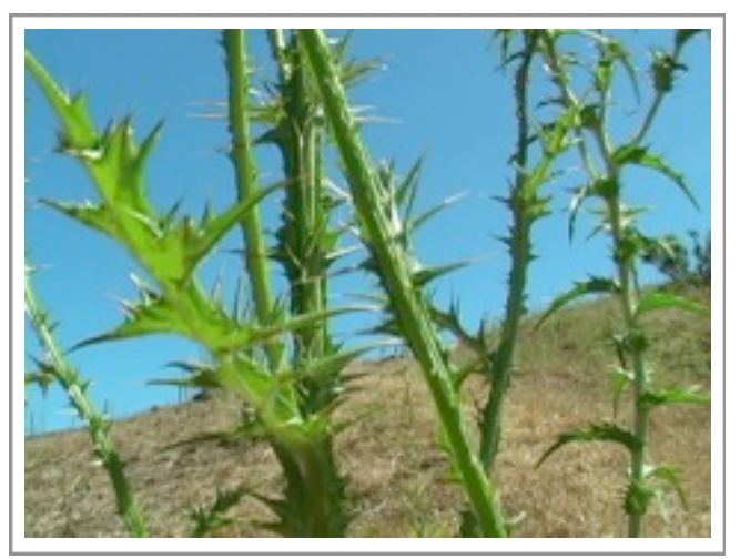
Cows eat Italian thistle in spite of it's 1/2 inch spines.

B. "_____ is probably unpalatable when mature because of the stiff, spine-like bracts in the flower clusters/ long, sharp spines, etc."