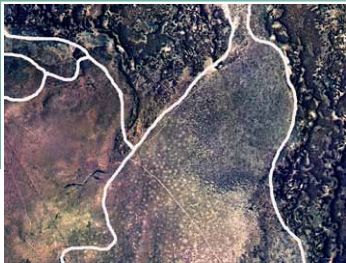
LAURA M. BURKETT (D2932-1)

Then the team developed ecological-state descriptors for different soils. They assessed factors such as USDA's Natural Resources Conservation Service (NRCS) soil data, STM soil characteristics, plant functional groups, responses to disturbance, and soil erosion patterns. Through this process, the scientists