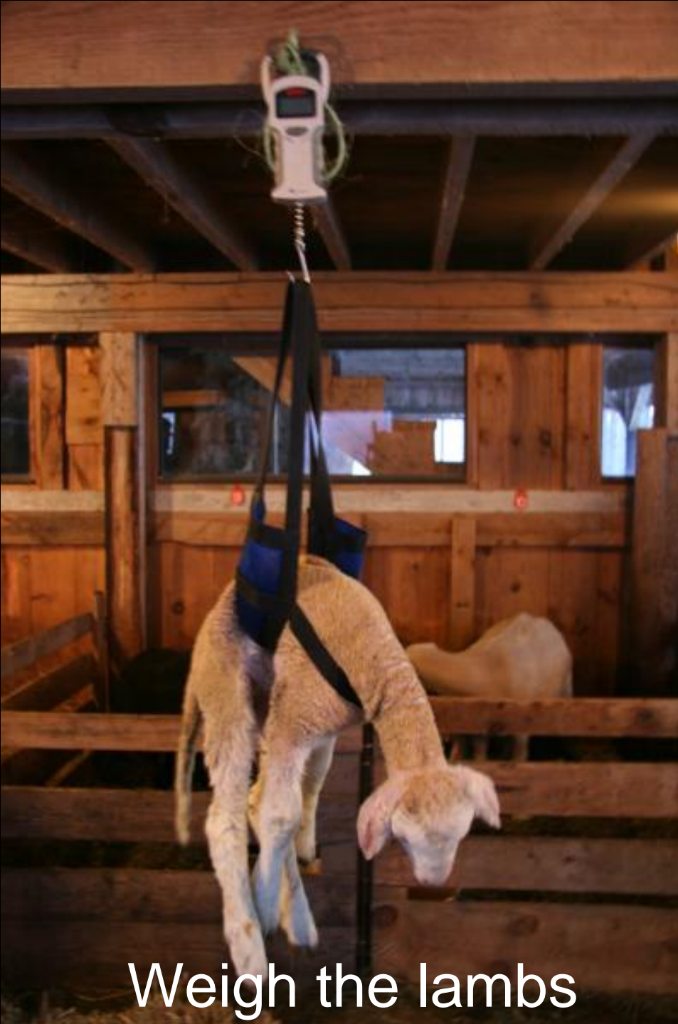
Weigh the lambs