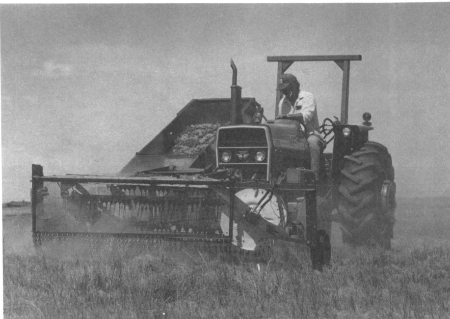
Pricklypear harvesting in about 1939 (top) and in 1980's (bottom).

the staff rode to survey damage. The blizzard of 1949 practically buried the buildings and prevented all travel. Droughts in 1939 and 1954 were severe but the worst was in 1964 when essentially no forage was produced on upland sites.