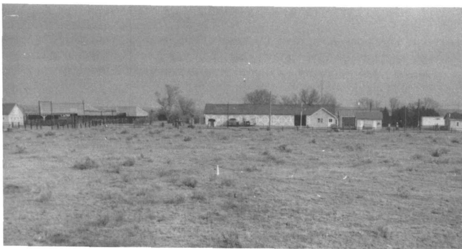
CPER headquarters in about 1939 (top) and in 1989 (bottom). The shrub is fourwing saltbush, common on sandy range and flood plain sites.

tary approved a Forest Service request for an experimental range in Weld County. The northwestern corner of the Land Utilization project area was chosen for the Central Plains Experimental Range. The original project contained 8,440 acres of Federal land but was soon expanded to 9,440 acres. The Experimental Range's main mission was, and is, to solve range management problems of the shortgrass prairie.